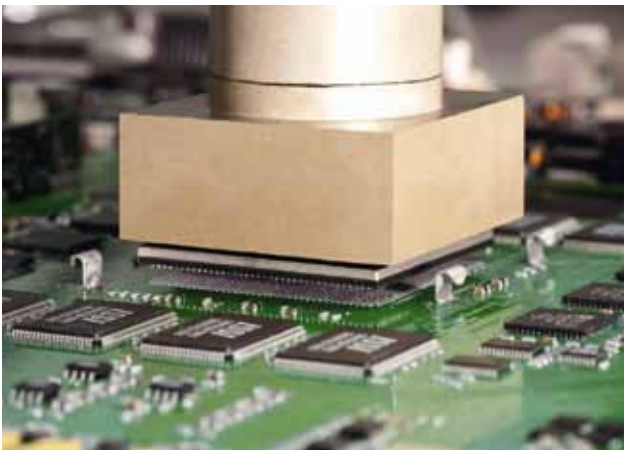
Electronic assemblies from the company Zollner

In conclusion, he states: "And when this is viewed against the background of cycle time and component test coverage, it is obvious the inspection combination with the fully equipped AOI section of the X7056 presents tremendous advantages."