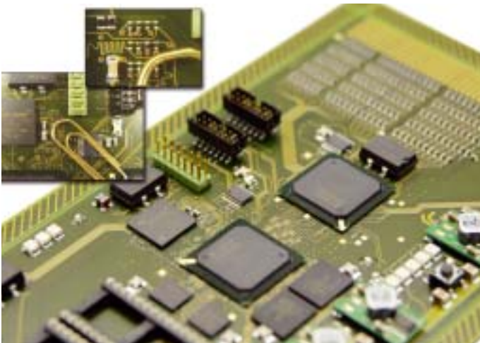
Rommtech product example PCB