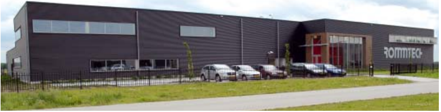
Rommtech Headquarters in the Netherlands

Rommtech a decision was made in favor of the combined AOI/AXI-inspection by Viscom.