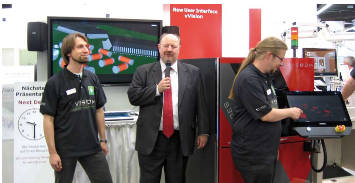
Presentation of the new user interface „vVision“ at the trade fair “SMT Hybrid Packaging 2010”