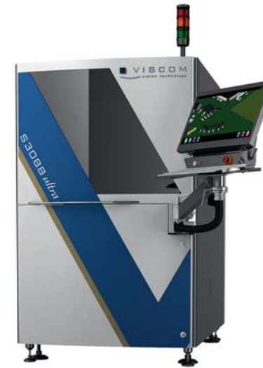
The 3D AOI system S3088 ultra gold from Viscom convinces users with its ultra-modern high performance camera technology and highest throughput