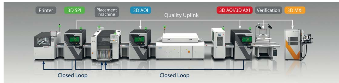
The inspection systems from Viscom are intelligently linked in the production line

In the medium term, only those electronics producers that meet the highest quality requirements and optimize their production processes will stay in business. To avoid defects, the causes must be identified and systematically eliminated. Linking various inspection gates creates wide-ranging possibilities for cost optimization and process reliability and permanent improvements in product quality. Constant development of inspection technology is essential.