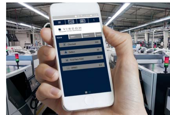
Mobile real-time access to production and quality with the Viscom app