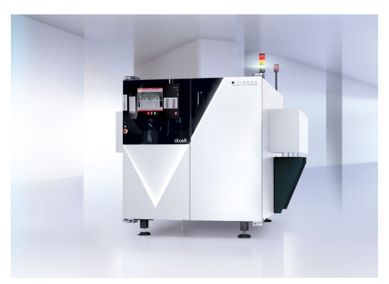
Inline X-ray system iXcell from Exacom

solutions. A constant innovation-driven exchange between Exacom and the parent company with its broad spectrum of inspection technologies guarantees a high degree of diverse creative impulses.