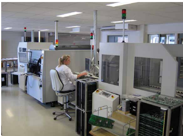
Inspection System X7056 at Rommtech in Halsteren