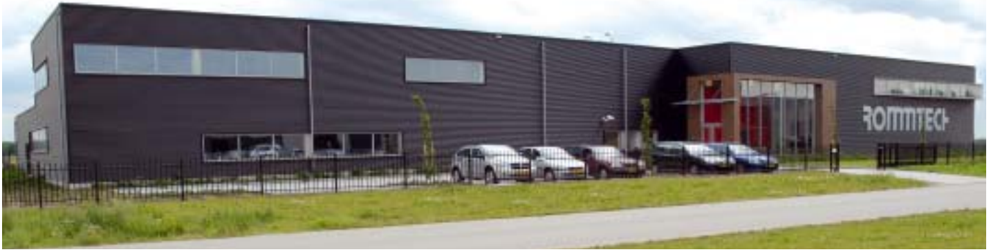
Rommtech Headquarters in the Netherlands

Rommtech a decision was made in favor of the combined AOI/AXI-inspection by Viscom.